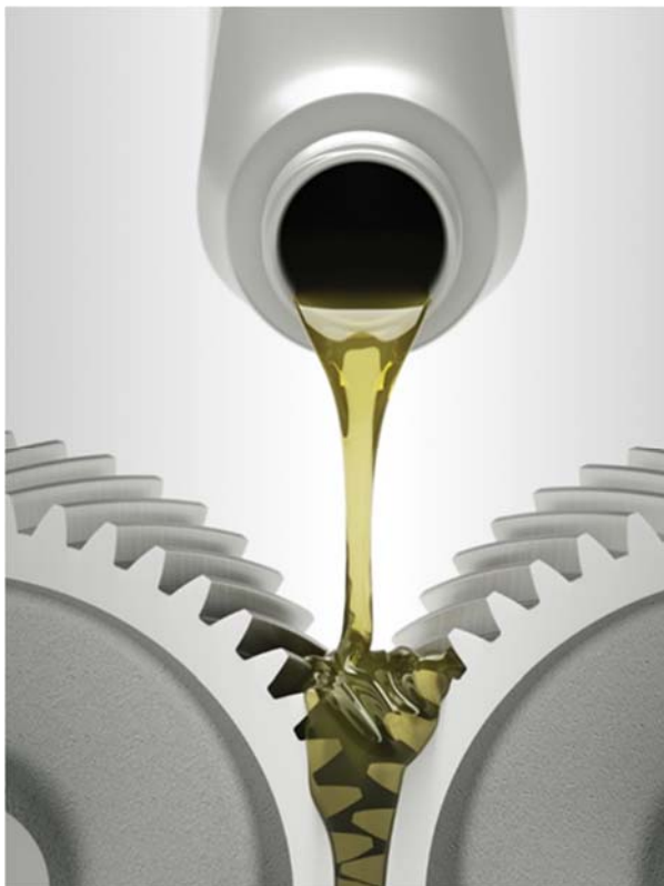
Caption picture 1: Gear oils formulated to NUFLUX™ technology standards with VISCOBASE® 5-220 have a particularly long service life between fewer drain intervals.